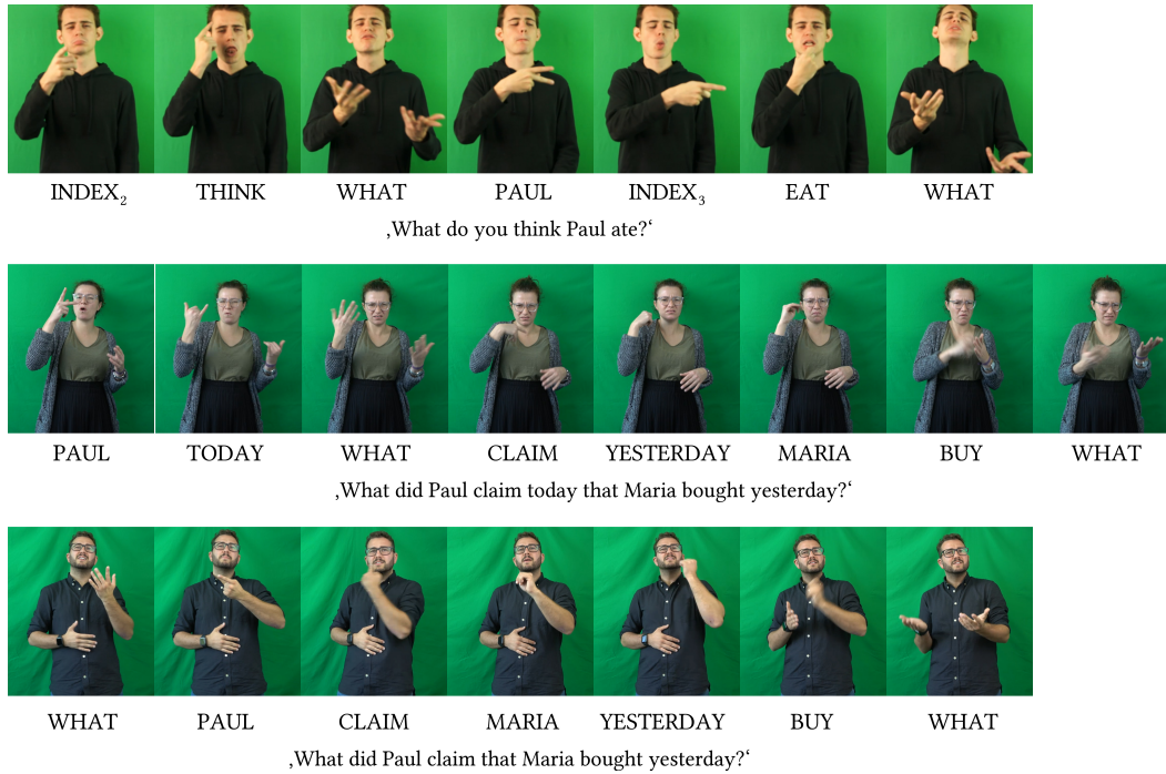
Figure 1: Three examples of relative clauses embedded in wh -questions from German Sign Language (from my own corpus; all signers are native signers having acquired DGS from birth).

Intended: ‘What kind of book did you read?’